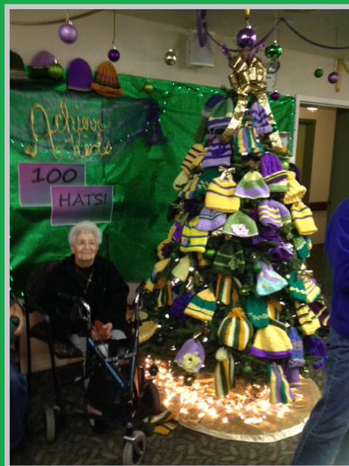
First prize winner at Lytton Gardens Festival of Trees, 2013